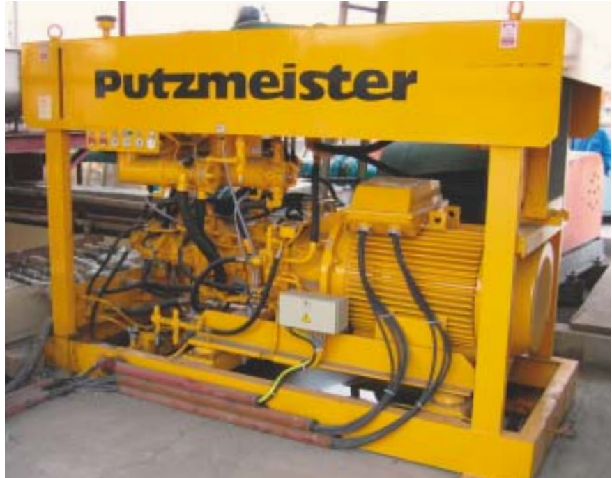
Hydraulic power pack HA 132 E