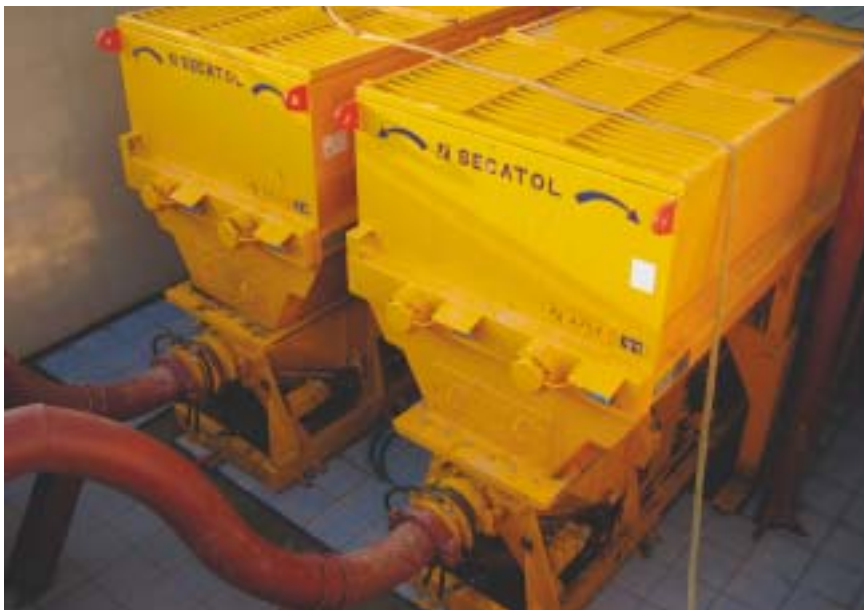
Two S-tube pumps with integral Secatol inlet and mixing hoppers with a volumetric capacity of approx. 7m 3

The material to be pumped is the excavated material from the tunnelling machine, which is conveyed to a sedimentation tank to be separated from its very high water content. The material is very fine and sandy and has a solids content of approximately 40 % and a pressure loss of approximately 0.08 bar/m.