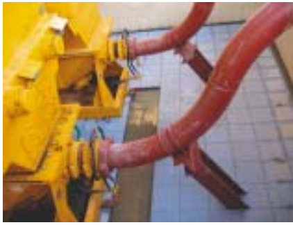
BLI concentric nozzle with water connection for reducing pressure losses