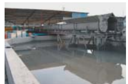
A digger fills the supply screw conveyors with sedimented sludge

◀ A screw conveyor supplies each inlet hopper with sludge